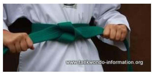
And pulls the ends tight. And that's it. Perfect!

Stay Home when you're Sick: Taekwondo is a challenging aerobic workout. If your child is feeling under the weather, it's not a good idea to take him or her to class. And, of course, that helps prevent colds and flus from spreading among all the students in the school. Likewise, if y our child injures a joint (mild muscle pulls or tendon sprains are common) let the joint fully heal before resuming workouts.