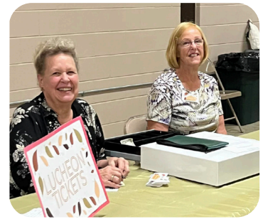
Many volunteers helping at the 2023 Fall Bazaar